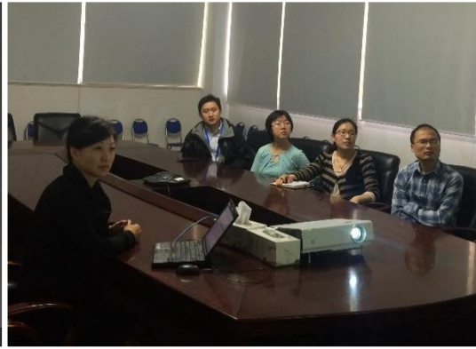
Researchers watching the webinar from the National Shanghai Center for New Drug Safety Evaluation & Research in Shanghai, China

HESI RISK21 Case Study/Web Tool Workshop. A 1.5-day hands-on case study workshop was hosted at the US FDA's Center for Food Safety and Applied Nutrition in College Park, Maryland, on 28–29 May 2015. The workshop was attended by 28 scientists from the US FDA and the US EPA and involved 11 case examples designed to illustrate the RISK21 approach and the use of the online RISK21 matrix web tool (available at <a href="http://risk21.sciome.com">http://risk21.sciome.com</a>). Follow-up case study workshops are planned for October 2015 in Taiwan and China. For more information, please contact Michelle R. Embry (membry@hesiglobal.org).