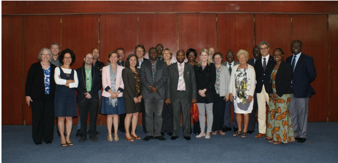
Faculty of speakers, 11-12 August 2014 Food Allergy and Safety Assessment Workshop, Nairobi, Kenya

11–12 August 2014 Food Allergy and Safety Assessment Workshop. A faculty of 20 speakers from Europe, the United States, and East, West, and South Africa shared research, experiences, and perspectives on food allergy and agricultural biotechnology safety assessment to a group of over 60 participants. Significant discussion and information sharing were featured during the two-day event. Workshop materials and presentations can be found here .