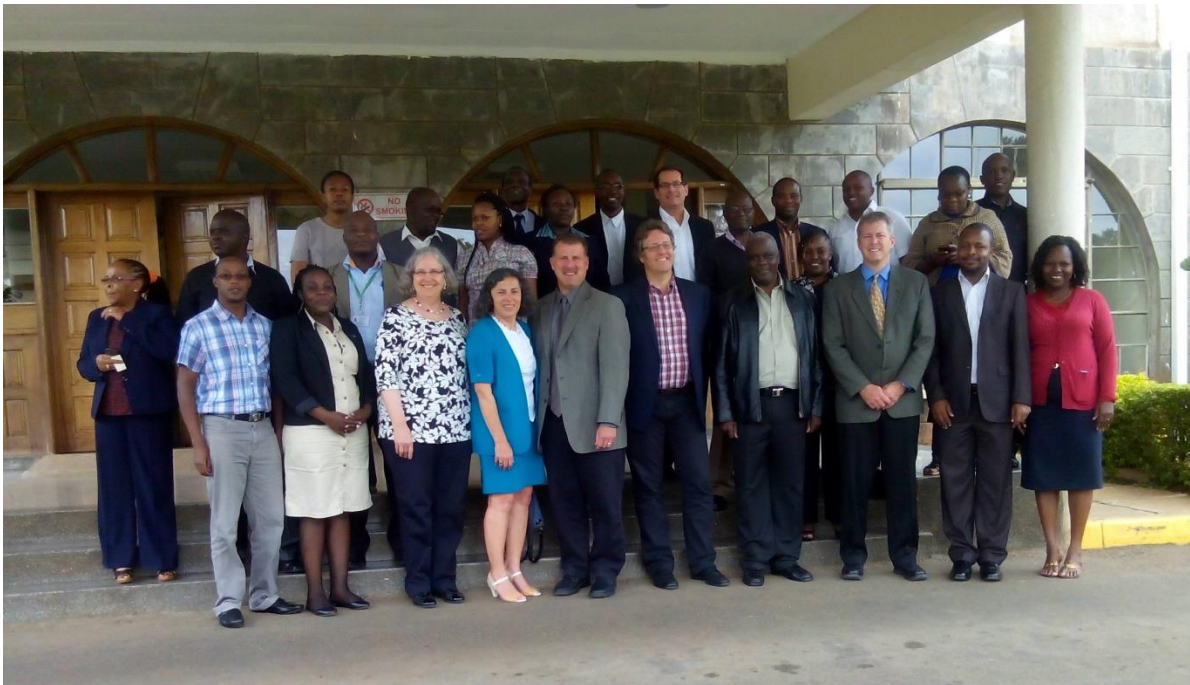
Participants in HESI PATC-sponsored training workshop for regulators on GM Food/Feed Safety Assessment, 7-8 August 2014, Nairobi, Kenya.

Approximately 25 Kenyan government representatives participated in this interactive workshop held at the KCB Leadership Center just outside Nairobi. Agencies represented included the NBA, Kenya Plant Health Inspectorate Service, National Environment Management Authority, Kenya Port Health, Department of Veterinary Services, National Public Health Laboratories Services, Kenya Medical Research Institute, and the Kenya Bureau of Standards. Workshop materials and presentations can be found here .