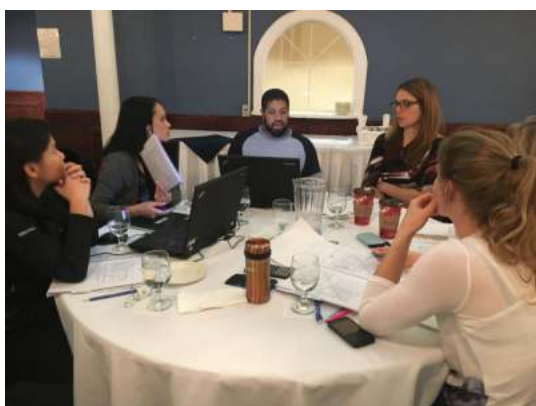
RISK21 training in action.