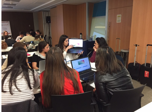
Workshop participants, at the Bayer Crop Sciences site in Sao Paulo, engage in hands-on, small-group case study work.