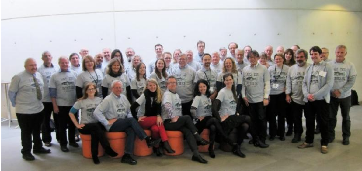
Effluent workshop attendees donning their "Save the Fatheads" t-shirts.