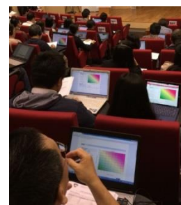
The RISK21 web tool in action in Taipei, Taiwan

A 1.5-day workshop with nearly 100 participants was held in Nanjing, China, on 22–23 October, hosted by the Department of Food Safety Standards and the National Health and Family Planning Commission. The event was organized by the China National Center for Food Safety Risk Assessment and ILSI Focal Point in China and co-organized by the Jiangsu Provincial Center for Disease Control and Prevention. Food safety risk assessors from every Chinese Province attended the workshop.