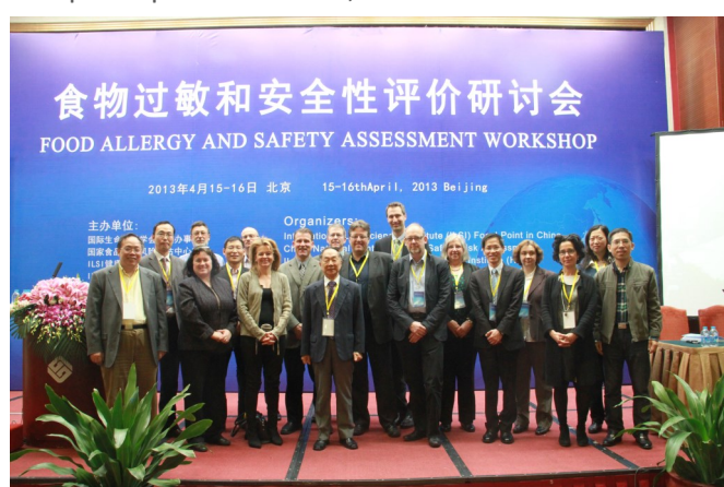
Speakers at the April 2013 Beijing Food Allergy and Safety Assessment Workshop.

HESI in China. The HESI Protein Allergenicity Technical Committee (PATC) co-sponsored a "Food Allergy and Safety Assessment Workshop" on 15-16 April 2013 in Beijing, China. The workshop was co-sponsored by the ILSI Focal Point in China, the ILSI International Food Biotechnology Committee (IFBiC), the China National Center for Food Safety Risk Assessment, and the China Key Laboratory on Food Safety Risk Assessment of the Ministry of Health. The objectives of the workshop were to describe the state of the science in assessing protein allergenicity, toxicity, and composition analysis of biotechnology-based food crops; identify and discuss accepted standards as well as innovative approaches being utilized to address clinical allergy; and discuss the safety framework for genetically modified crops, the regulatory approval processes, and how they are implemented globally. Clinicians reviewed allergy prevalence and study design strategies. Approximately 180 participants attended, most of whom were from